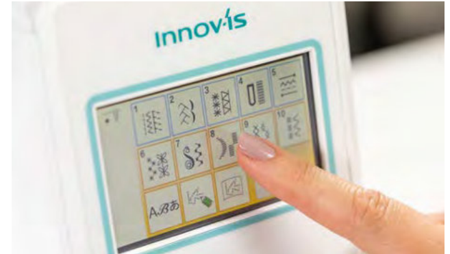
Colour LCD touchscreen