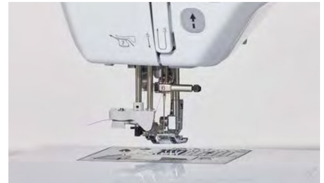
Advanced needle threader