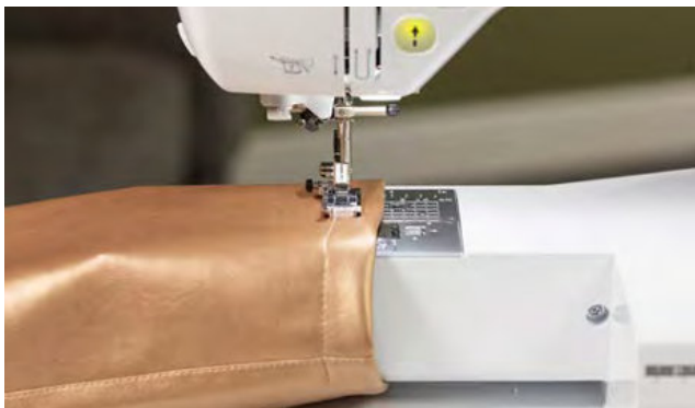
Free arm sewing