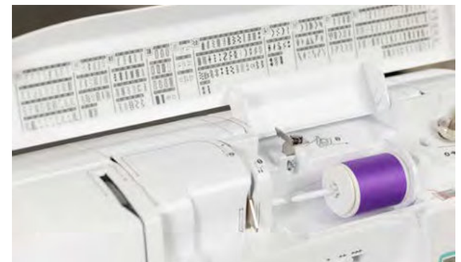
241 built-in sewing and decorative stitches