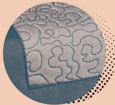
Darning / embroidery