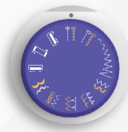
Easy Stitch Selection