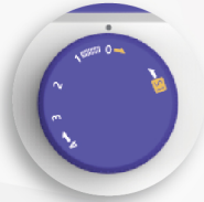
Variable Stitch Length (for 2 dials)